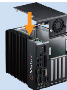
3. Seat the fan module cover and slide into place, the fan connects automatically