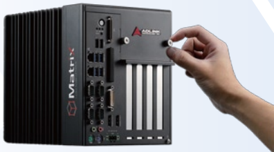
1. Undo the thumbscrews by hand