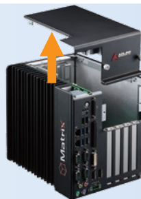
2. Withdraw the thumbscrew and remove the top cover