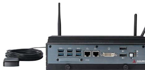
MXE-5400 with Antenna