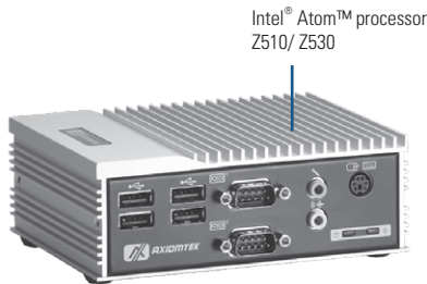
▲ Front view

Fanless Embedded System with Intel® Atom™ Processor Z510/ Z530 up to 1.6 GHz and Wide Range DC-in