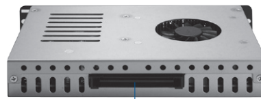
▲ Rear view