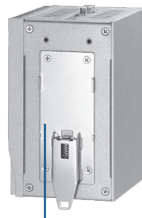
Din-rail kit ▲ Rear view