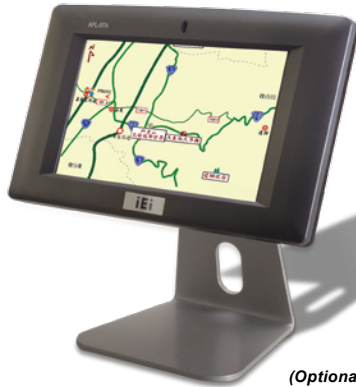
(Optional Stand Kit)