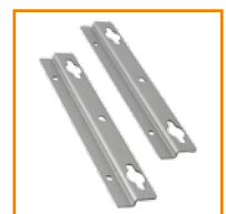
Wall Mount bracket