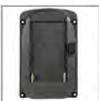
F970 Battery Plate