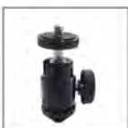
Hot Shoe Mount