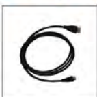
Mini HDMI Cable