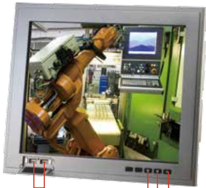
USB x 2 LCD On/Off Brightness + Brightness -

17" Rugged Fanless Touch Panel Computer With Intel® Celeron® 827E/ Core™ i7-2610UE Processor, 2GB RAM