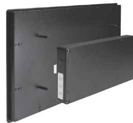
▲ Modulized design