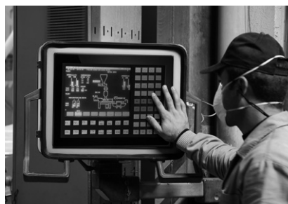
▲ Ideal for factory automation & self-service kiosk in retail