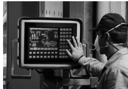
▲ Ideal for factory automation & self-service kiosk in retail