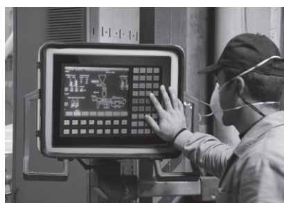
▲ Ideal for factory automation & self-service kiosk in retail