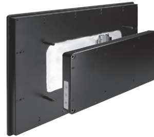
▲ Modulated design