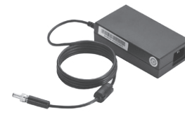
▲ AC power adapter (GOT5152T-834-J)