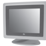
▲ Desktop stand