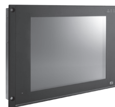
▲ Touch without keypad version