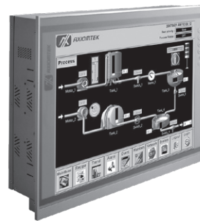
▲ Side view