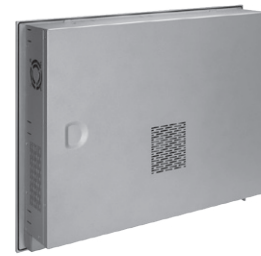
▲ Less screw design